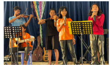
THE GIFT OF LEARNING MUSIC