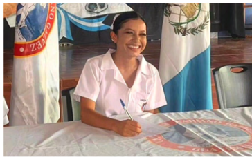
NEXT STEPS COLLEGE SCHOLARSHIPS