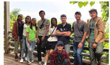
RETREATS FOR NEXT STEPS STUDENTS AND DISCIPLESHIP LEADERS