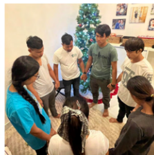
LOVE OFFERING FOR OUR MISSION PARTNERS