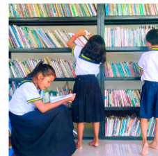
OPEN DOORS THROUGH ENGLISH LEARNING