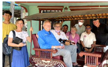
MISSION TEAM LEADERS TO SERVE OUR PARTNERS