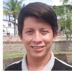
Jelbin Law School