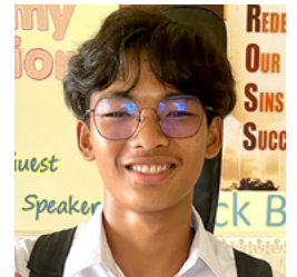
Luch Electrical Engineering