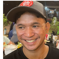
Buntheang Bible College