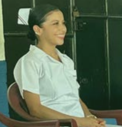
77 Children impacted by loving Parent Partner families

22 Students pursuing a brighter future in our Next Steps Scholarship Program